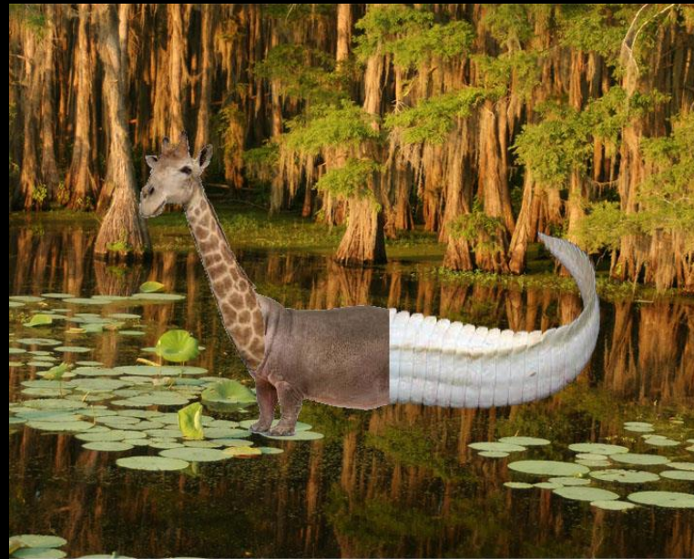
Irwan Pervall, 2017